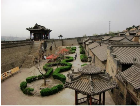
Wang Family Courtyard

Breakfast at hotel, your tour takes you to the Wang Family Courtyard . You will see why it is considered more of a castle than a home, explore the grand Qing Dynasty former residence, which has been well maintained as evident in the wooden galleries fronting many of the courtyard structures. This huge area has 123 beautiful courtyards and is interspersed with gardens, it is worth climbing the walls around for an excellent view. Lunch will be served at a local restaurant.